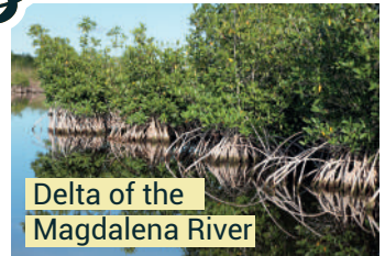
Delta of the Magdalena River