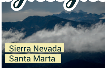
Sierra Nevada Santa Marta