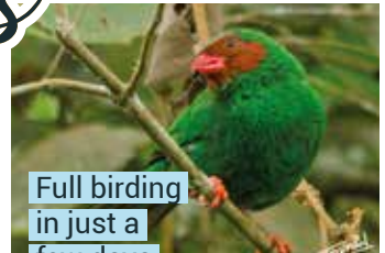
Full birding in just a few days